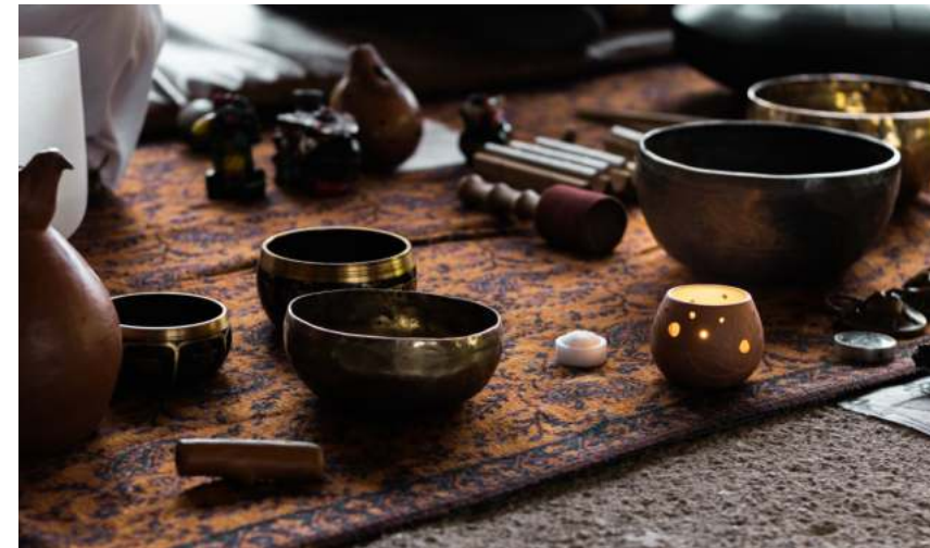
Sound Bath Meditation

Please register online at www.wmtl.org/events , visit the Adult/Teen Services or call 973-728-2822.