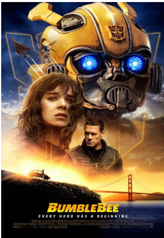
Bumblebee, June 29

For more information call the Adult Services desk at 973-728-2822 or visit www.wmtl.org .